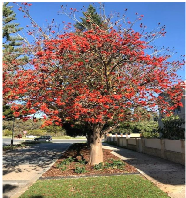
New trees planted on Eze Terrace