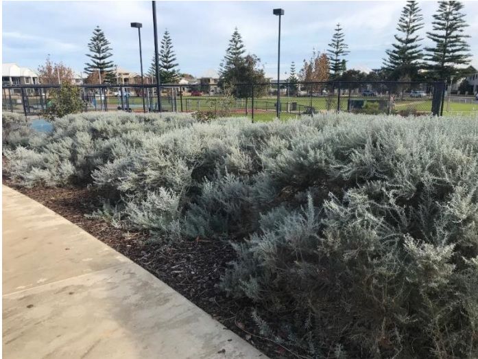
Harbour View Park before works to replace end-of-life shrubs. The second picture shows the extent of issues which only get worse over time and therefore need for replacement

Below are some selected photo's that show works undertaken during the year.