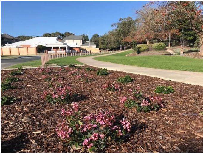
Entry Statement new plantings and mulch replacement