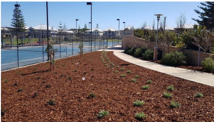
Harbour View Park after works to replace end-of-life shrubs.